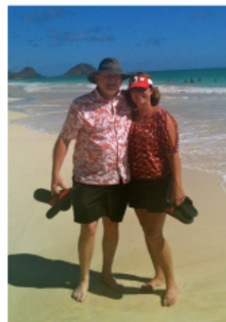
Bellow AFS Beach, Hawaii 2014